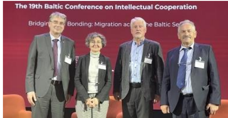
2025 Annual Meeting of the ISC European Members